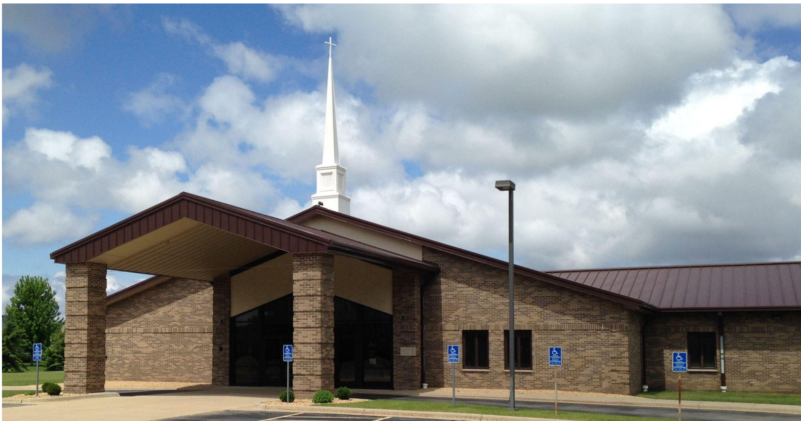
Cornerstone Evangelical Free Church of Owatonna Minnesota